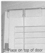
1. Place on top of door