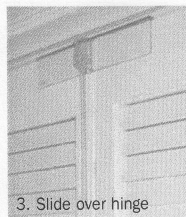
3. Slide over hinge